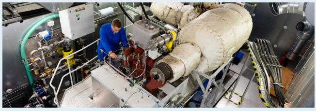
Engine test field for research into alternative fuels.