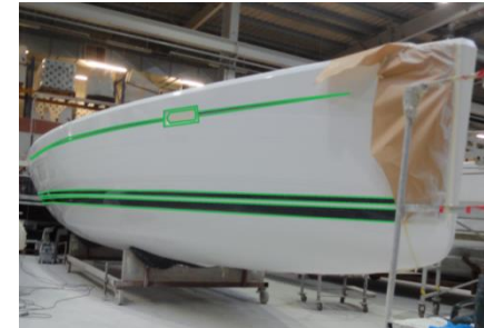
Marking of the waterline and monitoring of hull openings