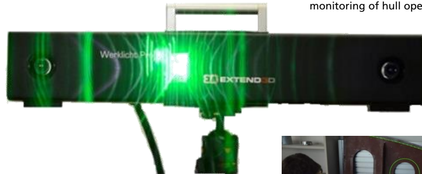
Projection system Werklicht-Pro