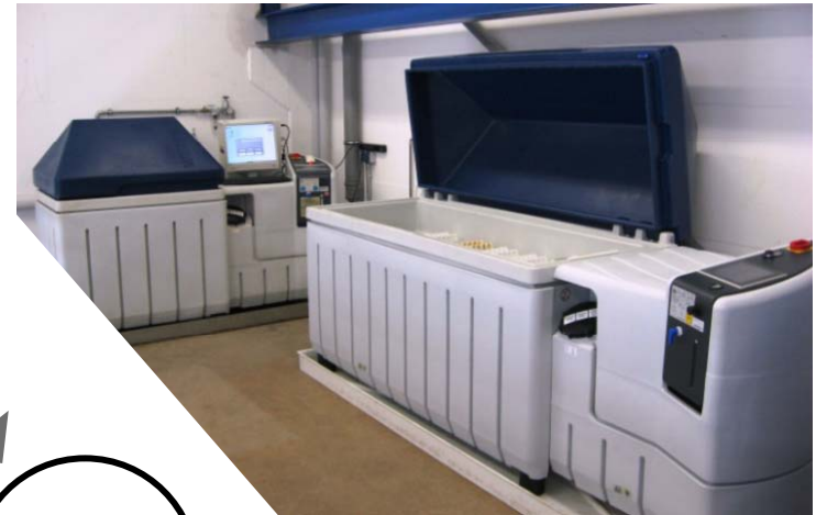
Test chambers SC/KWT 450 (left) and SC/KWT 1000 (right)

Corrosion investigations in the QUV test chamber